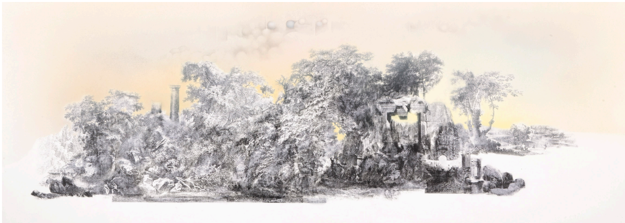
Anouk Mercier. Adeachus' Gate , 2015, Airbrushed Inks, Acetone Transfer, Colour Pencil and Graphite on Paper, 102 x 39.5 cm (40.2 x 15.4 inches)

DALLAS / FORT WORTH - CYDONIA is pleased to announce its first POP-UP EXHIBITION SURVEY OF SURVEYS in Fort Worth. Hailed as the city “where the west begins,” CYDONIA curated a concept correlated to new frontiers and exploration. In collaboration with the Arts Council of Fort Worth and Fall Gallery Night, CYDONIA presents a selection of diverse artworks created by artists from Canada, Scotland, Mexico, and France, all depicting different versions of landscapes. THE EXHIBITION OPENS ON SATURDAY, SEPTEMBER 10 FROM NOON UNTIL NINE PM AT A TEMPORARY SPACE LOCATED AT 2955 CROCKETT STREET (76107) IN THE WEST SEVENTH DEVELOPMENT. THE POP-UP EXHIBITION WILL RUN UNTIL THURSDAY, SEPTEMBER 17 WITH SELECT HOURS.